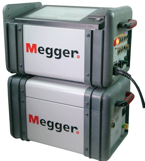
DELTA4310A test set shown above with onboard computer